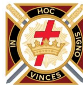
Defending the Word

FOR MORE INFORMATION CONTACT US AT TRINITYYRSC@GMAIL.COM