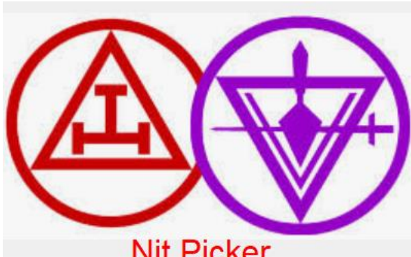
Nit Picker Degree Team