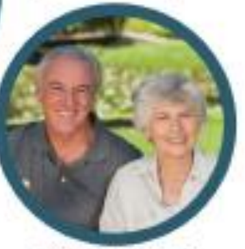
"It's better than we could have imagined!"

We have so much fun. And, we know help is just minutes away."