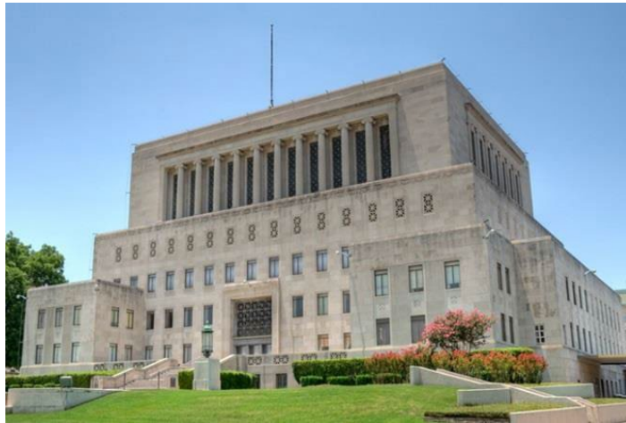
Fort Worth Temple 1100 Henderson Street, Fort Worth, Texas