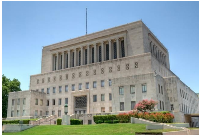
Fort Worth Temple 1100 Henderson Street, Fort Worth, Texas