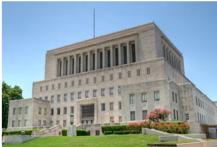
Fort Worth Temple 1100 Henderson Street, Fort Worth, Texas