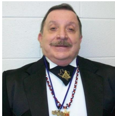
Pre-Eminent Governor Joseph Spencer