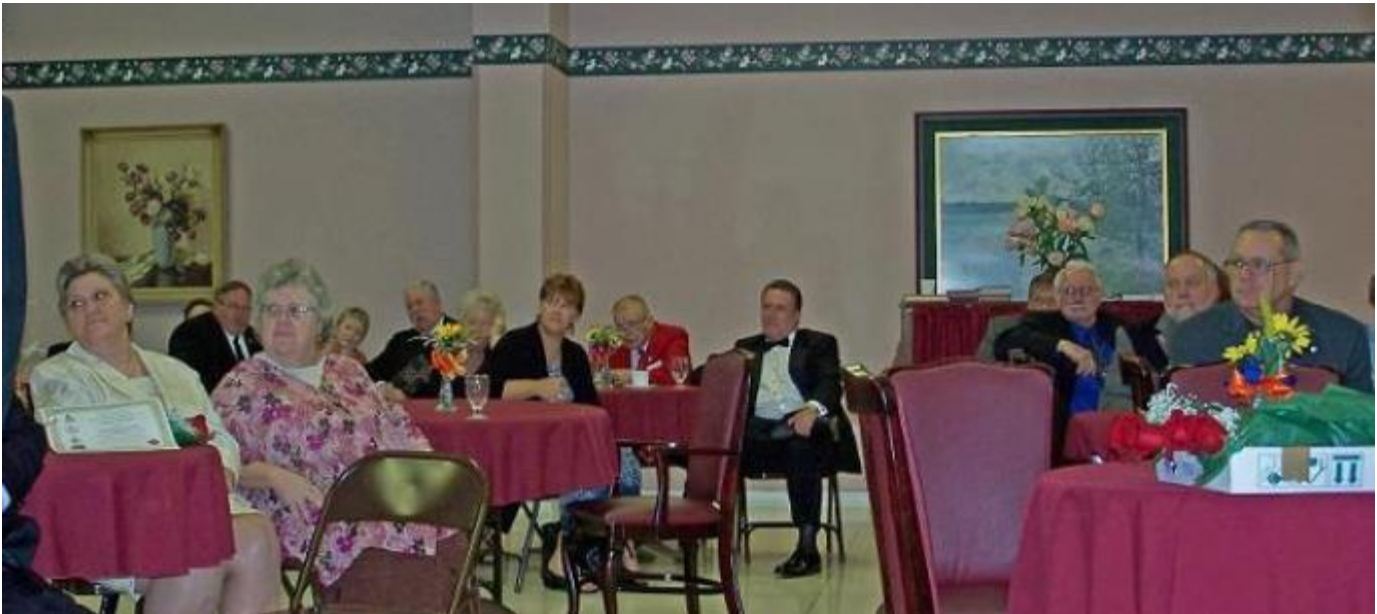
Here are some 2007 pictures, we had about a hundred in attendance honoring the Worshipful Masters.

Here are some pictures of past events honoring the WM's.