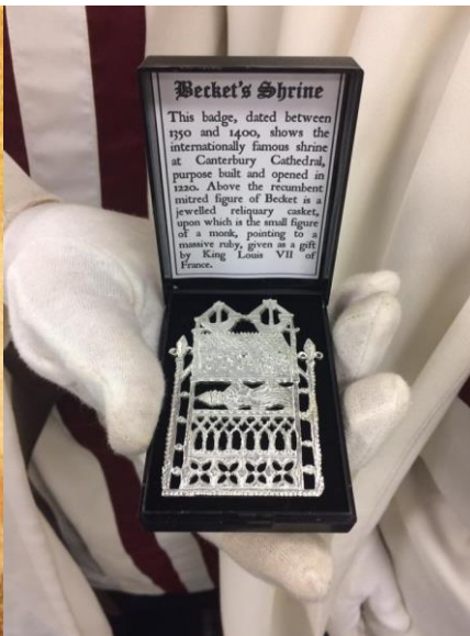
Becket's Shrine (badge)