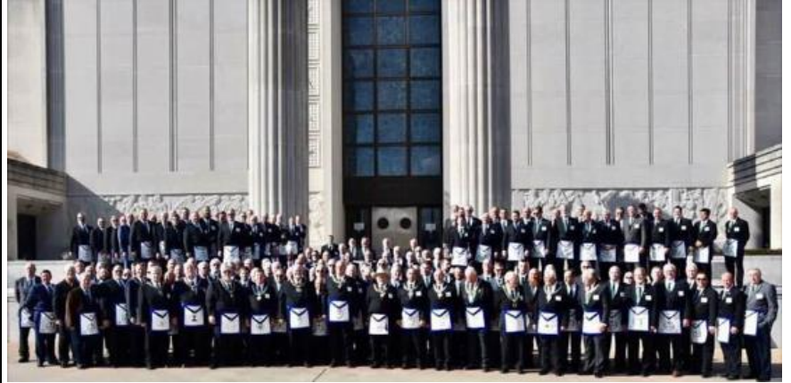
2017 Grand Lodge Officers and District Deputies