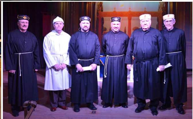
Pictured above are a couple of our Fort Worth Valley degree teams