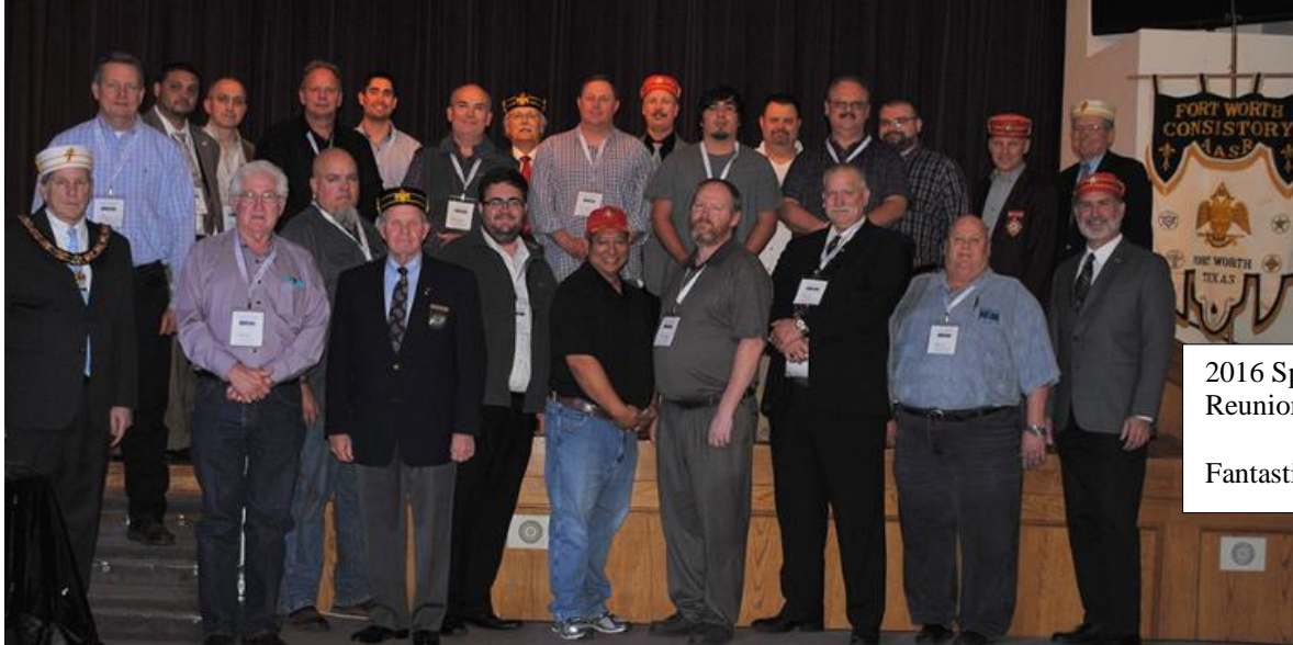
2016 Spring Reunion Class. Fantastic Masons