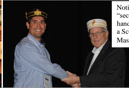
Notice the “secret handshake” of a Scottish Rite Mason