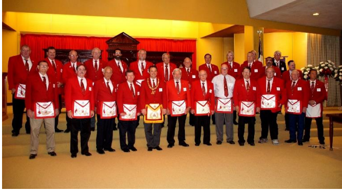
Grand Chapter Officers