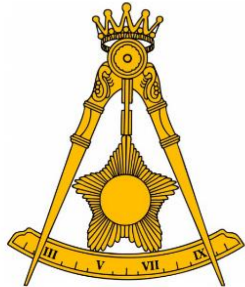
Lodge of Perfection

The October Stated Meeting will be held at 6 PM in the Commandery Room. The meal and program will begin at 7 PM. Meal tickets will be available in the first floor foyer before the meeting, cost is $12.00. This month's program will be the celebration of the Feast of Tishri.