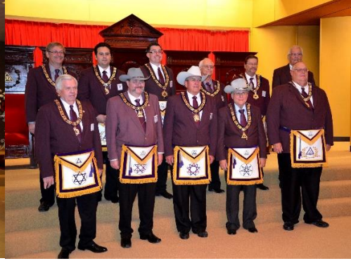
Grand Council Officers