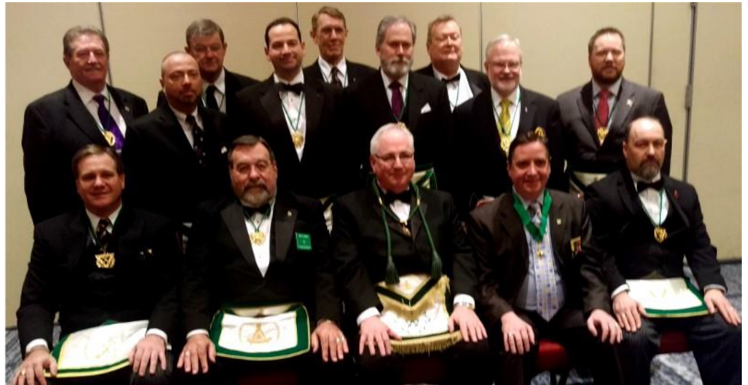
The 2016 Grand Council of the Allied Masonic Degrees Officers