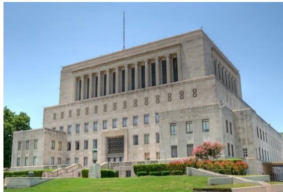
Fort Worth Masonic Temple 1100 Henderson Street, Fort Worth Texas

Past Grand Master of the Grand Council of RSM Texas