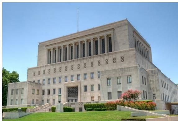
Fort Worth Masonic Temple 1100 Henderson Street, Fort Worth Texas

Past Grand Master of the Grand Council of RSM Texas