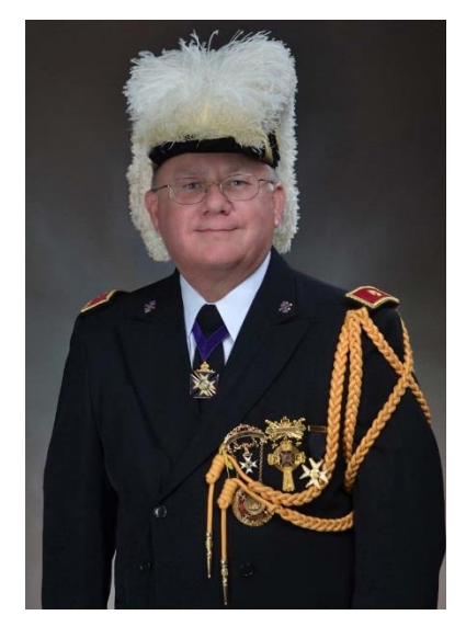
H. Bart Henderson Grand Governor of Texas

Location: Fort Worth Temple - 3<sup>rd</sup> Floor Red Room Date : 01/27/2015 Time : 6:45 PM (Following the Tarrant County York Rite Assocation) Purpose : Official Visit of the Grand Governor of Texas